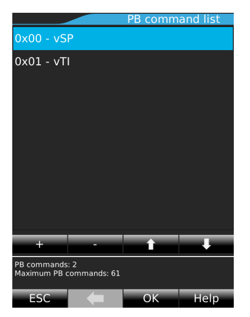
This configuration serves as the basis for the following examples.

The Pilot ONE<sup>®</sup> controller configuration in the following examples requires each PB package command to address 2 addresses that contain the setpoint (vSP, address 0x00) and the internal temperature (vTI, address 0x01).